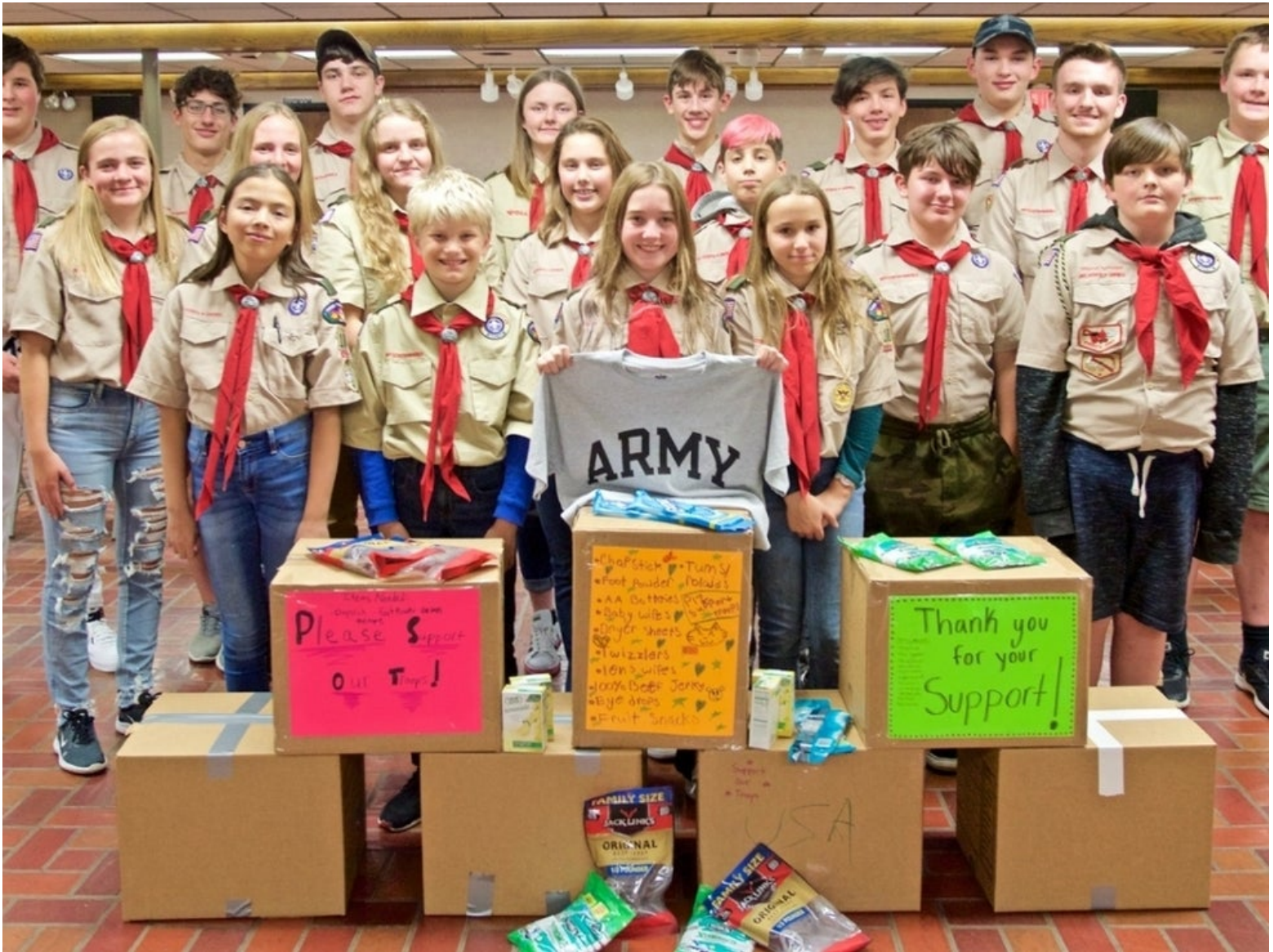
The Scouts of Naperville's Troops 100 and 6100 prepare to send off their packed donations for Operation Support Our Troops.

This post was contributed by a community member.